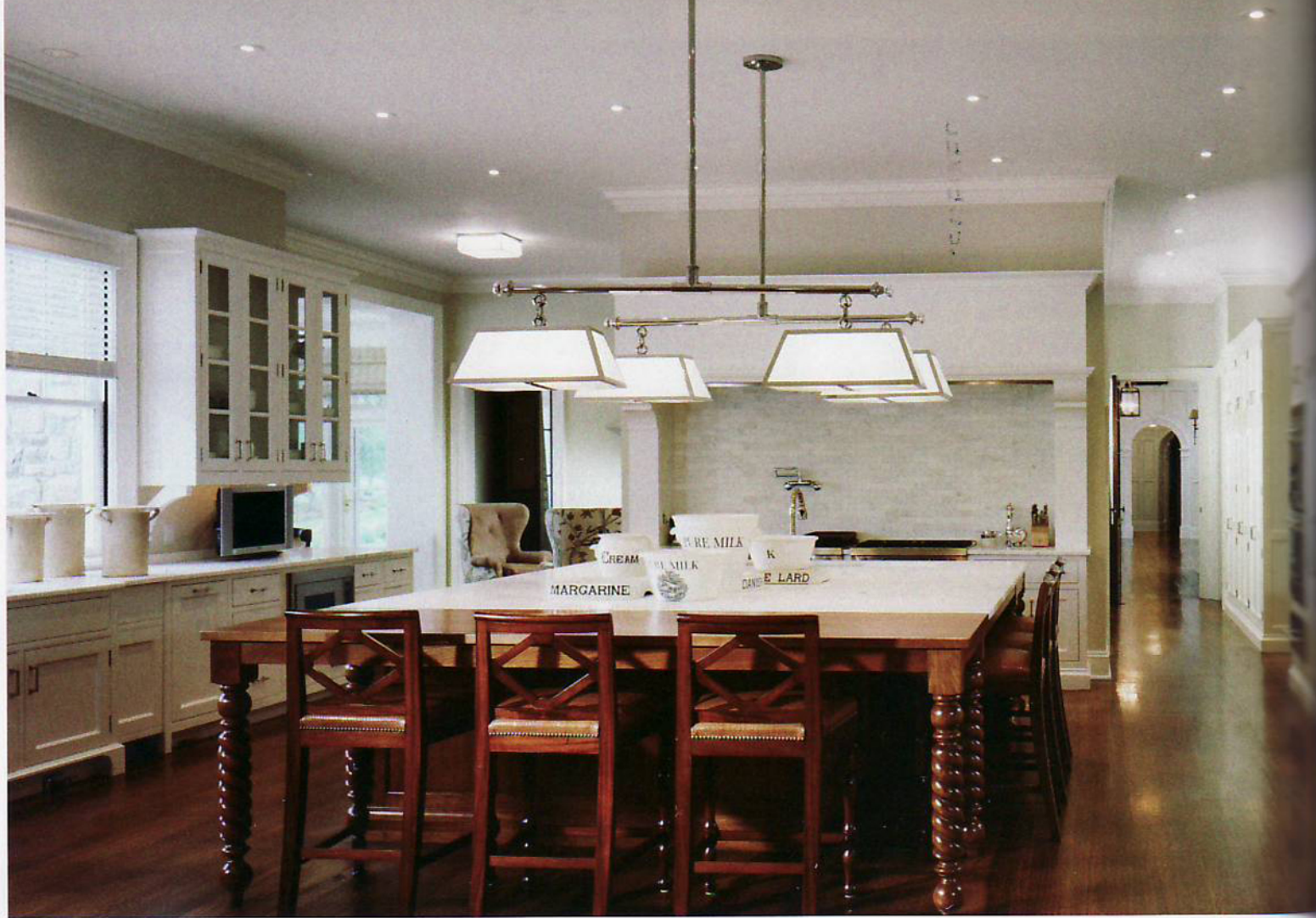
ABOVE With 12-foot ceilings and unobstructed views of the Sound, the kitchen is large enough to float an 8-by-12-foot island topped with honed Calcutta marble. LEFT A Mercury-glass mirror, stained mahogany paneling, and limestone and black marble flooring give this trapezoidal powder room a dark glamour. BELOW Inside the front door, a fluted column and low kneewall divides (but doesn't subtract) the classical foyer from the open living and dining rooms. OPPOSITE The Pier from Robards Landing, 195 feet out into the Sound. Paul Newman once arrived by raceboat to visit the previous owner, the late Jason Robards.